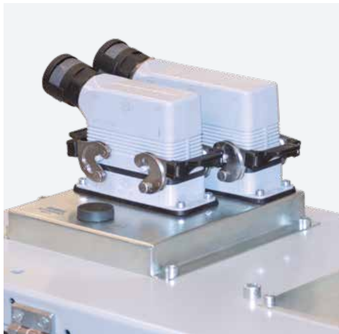
Industrial quick connectors for fast replacement.